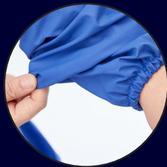
Double layer sleeve with hidden elasticated cuffs