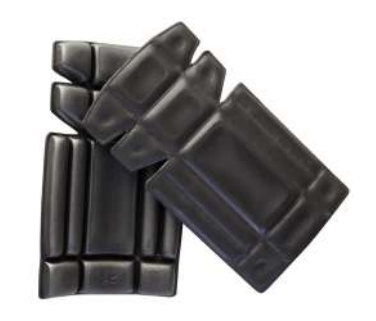
KNEE PAD PAIR - FOAM