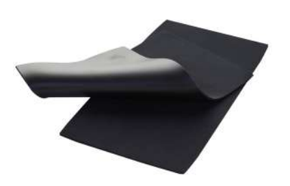
KNEE PAD PAIR - NEOPRENE